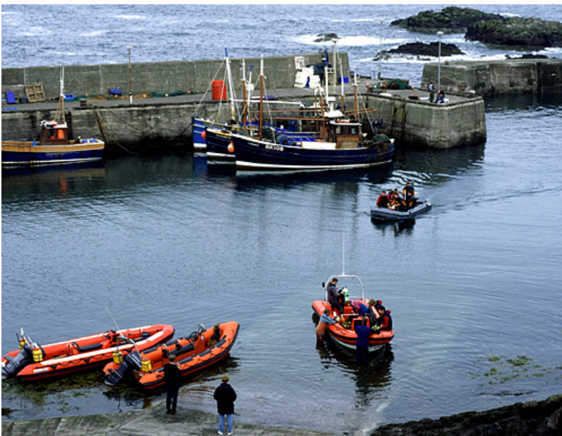
St Abbs Harbour

The en-suite bunk-house at the back of the skippers house proved to be much more luxurious than the 6 of us booked in there had expected. All the comforts of home on the inside and outside, a sunny patio overlooking the harbour where we sat and devoured hot breakfast rolls cooked to order by Billy's wife Alison.